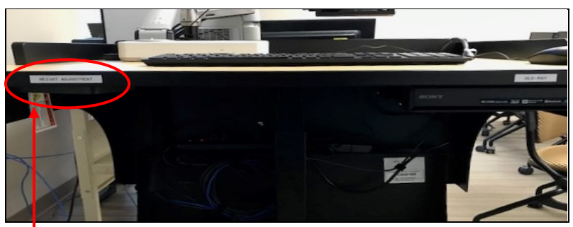
To adjust the height of the console, grasp the adjustment handle and squeeze towards you to release the mechanism. You can then raise or lower the console to desired height.

If you require any software or hardware that is not installed in this classroom, Please contact your office manager.