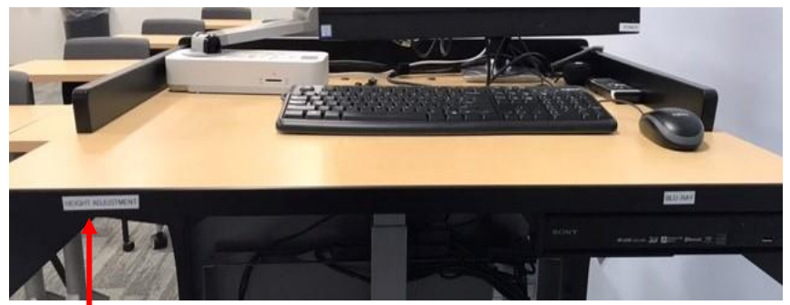
To adjust the height of the console, grasp the adjustment handle and squeeze towards you to release the mechanism. You can then raise or lower the console to desired height.

If you require any software or hardware that is not installed in this classroom, please contact your office manager.